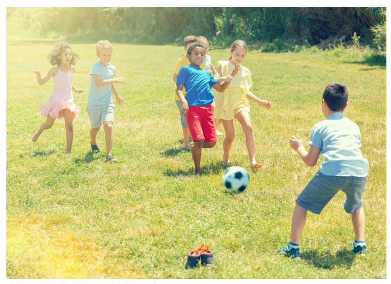
Children are less physically active than before.

With physical distancing affecting our social interactions, time spent on watching TV and using other digital devices has significantly increased. For example, the <u>Royal Children's Hospital's National Child Health Poll</u>, found half of Australian children had spent more time on digital screens for entertainment in June 2020 compared to the same period before the COVID-19 pandemic. And 42% of children spent less time being physically active.