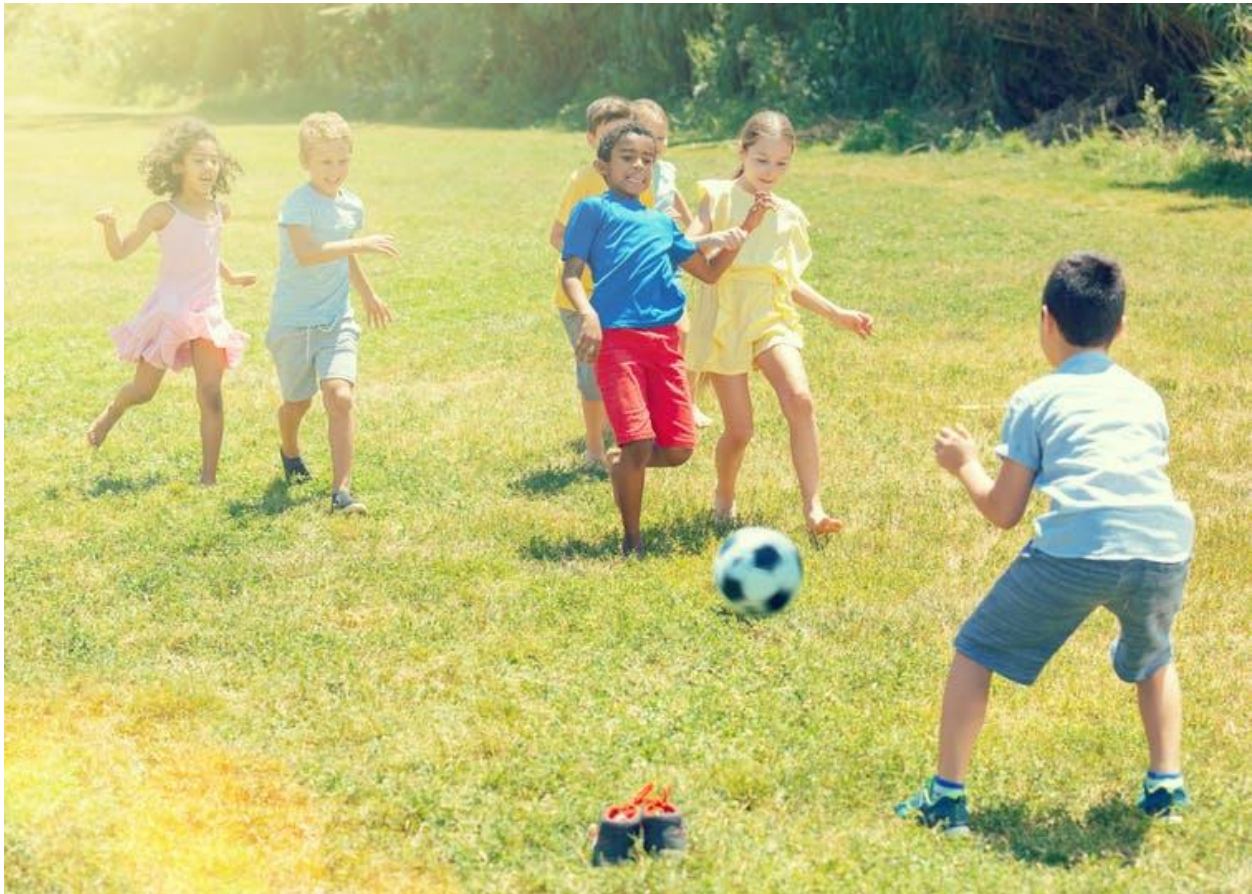
Children are less physically active than before.

With physical distancing affecting our social interactions, time spent on watching TV and using other digital devices has significantly increased. For example, the Royal Children's Hospital's National Child Health Poll , found half of Australian children had spent more time on digital screens for entertainment in June 2020 compared to the same period before the COVID-19 pandemic. And 42% of children spent less time being physically active.