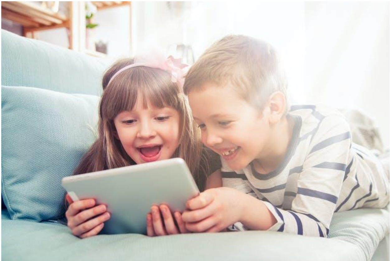
Children start owning digital devices at the age of four.

Our earlier research showed 84% of Australian teachers observed students being distracted by digital media and technologies. And three out of five believed students weren't ready to learn when they came to school.